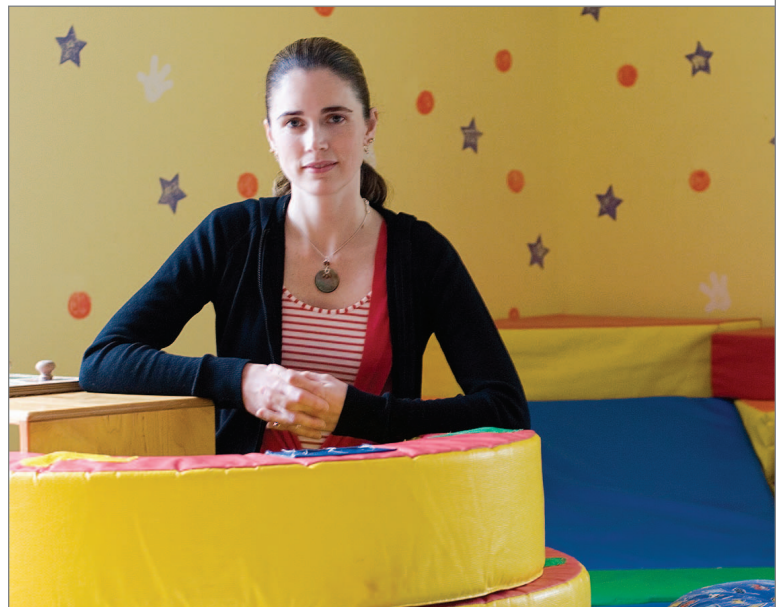
The Early Learning Center in Grafton, Mass. uses the Lexmark C500n for printing office documents and student progress reports.

Color documents were nearly banned since costs of inkjet cartridges made it prohibitive to create such documents to communicate with teachers and parents. Instead, the Early Learning Center opted for monochrome ones that were often printed once and copied several times to be handed out.